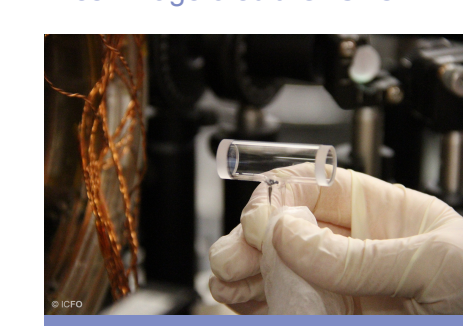
Picture of the glass cell where the rubidium metal is mixed with nitrogen gas and heated up to 450 degrees Kelvin. At that high temperature, the metal vaporizes, creating rubidium atoms that diff

In a study published in Nature Communications, ICFO, HDU and UPV researchers report the production of a giant entangled state that may help medical researchers detect extremely faint magnetic signals from the brain.